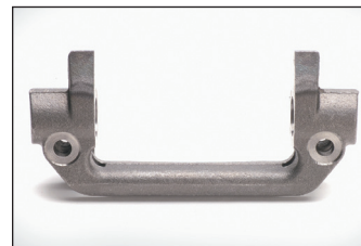
Most kits now include the most popular clutch release fork.