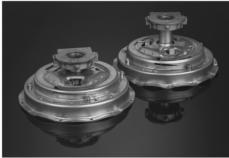
Solo® Adjustment-Free Single and Two Plate Clutches

Reliability and long life are certainly two reasons why Fuller Clutches are the number one selling clutches in North America. Eaton offers a complete line of push and pull type medium-duty clutches with application coverage from 100 to 330 horsepower engines and up to 1150 ft. lb. of torque. This bulletin provides application and adjustment guidelines to assure you the reliability and long life you've come to expect from Fuller Clutches.