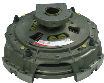
Solo® Adjustment-Free Heavy-Duty Clutch

The clutch that thinks it's a mechanic. It is a cost savings combination that has never been available before.